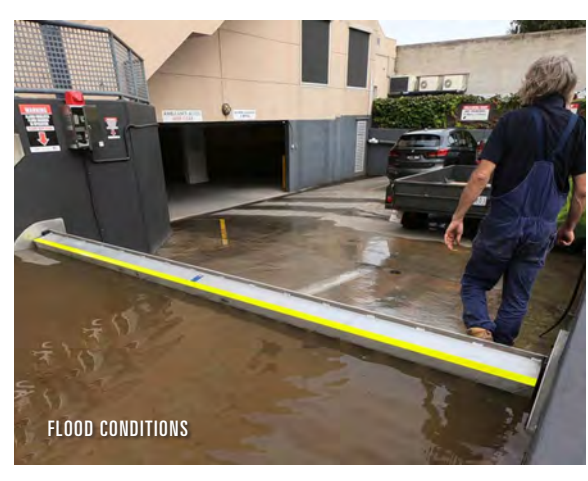
^ Pictured above is the FloodFree Passive Tilting Flood Barrier which self-deploys as water levels rise.